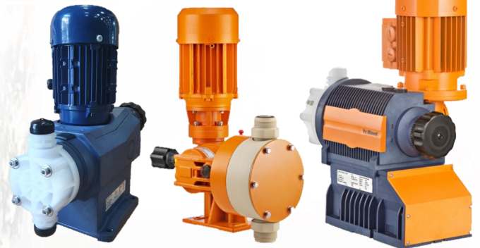
Motor-driven Metering pump