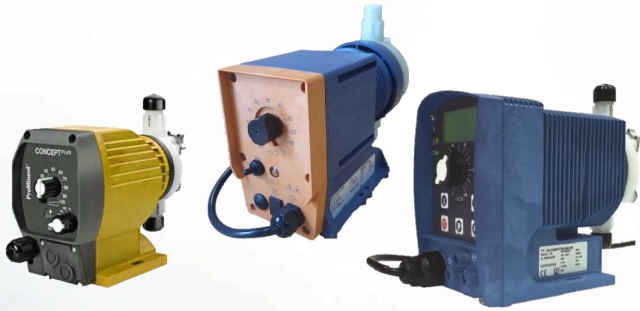
Solenoid-driven Metering pump

The all-rounders: metering pumps and metering systems